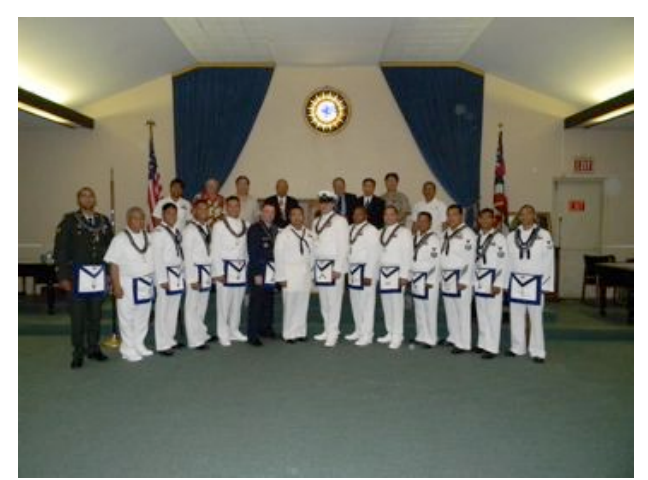
Hawaiian Lodge Military Degree Night

It breaks my heart to even think of asking these questions, but I must if only to express my sentiments hoping I could at least offer something for the Brethren's introspection. For whatever it is worth, in my 30 years of being a Mason, and as member of the Craft in three Jurisdictions, I cannot believe that there seems to be so much "drama" and "intrigue" in our Jurisdiction - especially considering how relatively small it is compared to other Grand Jurisdictions! It appears we are our own enemies, and, until we can be truthful and settle our differences among ourselves like the honorable gentlemen we profess to be, we will never have the harmony that we've been longing for!