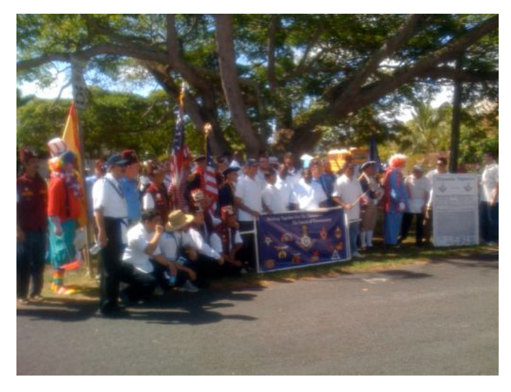
The Family of Freemasonry