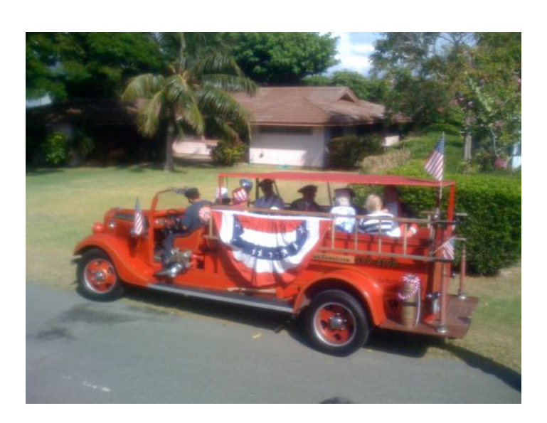
A Red Fire Truck provided some welcome relief from the marching