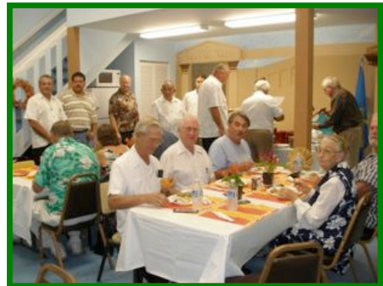
Kona brethren enjoying a Thanksgiving meal at the Kona Lodge Stated Dinner. Smiles everywhere to be seen.