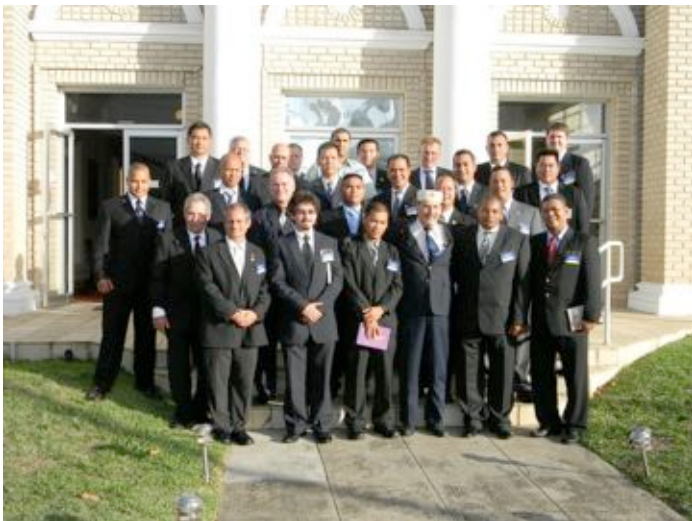
Scottish Rite 2010 Fall Reunion Class

Hurry They’re Going Fast! The Grand Lodge has a limited number of: Grand Lodge T-shirts Bolo-ties Pineapple Pins Get yours before they’re all gone.