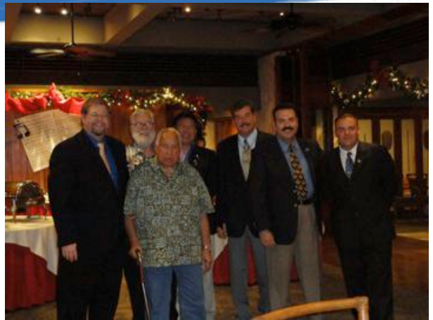
Honolulu Lodge Past Master's Dinner and Christmas Party at the Outrigger Canoe Club