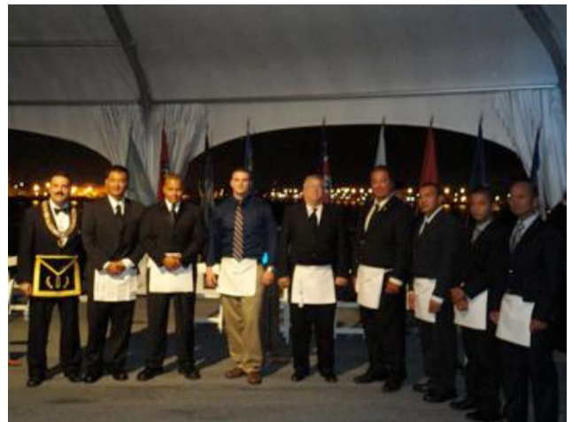
Newly raised Brothers on the USS Missouri Third Degree hosted by Honolulu Lodge

It has been an honor to represent the brethren as your Junior Grand Warden and I continue to learn as I go. I am committed to making this fraternity stronger and more honorable over the coming years and I can only do so with your assistance. Please support the Grand line of officers as we work to assist the lodges to be successful. We are not here to micro manage the lodges, but to ensure that there is an efficient administration of the lodges as a whole and ensure that the Hawaii Masonic Code is followed and that we all live up to our obligations as Masons.