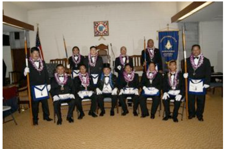
Leeward Lodge Installation of Officers