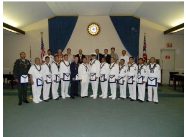
Hawaiian Lodge Military Degree Night

It breaks my heart to even think of asking these questions, but I must if only to express my sentiments hoping I could at least offer something for the Brethren’s introspection. For whatever it is worth, in my 30 years of being a Mason, and as member of the Craft in three Jurisdictions, I cannot believe that there seems to be so much “drama” and “intrigue” in our Jurisdiction – especially considering how relatively small it is compared to other Grand Jurisdictions! It appears we are our own enemies, and, until we can be truthful and settle our differences among ourselves like the honorable gentlemen we profess to be, we will never have the harmony that we’ve been longing for!